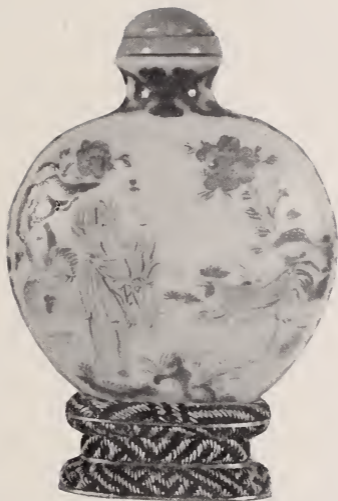
PORCELAIN SNUFF BOTTLE